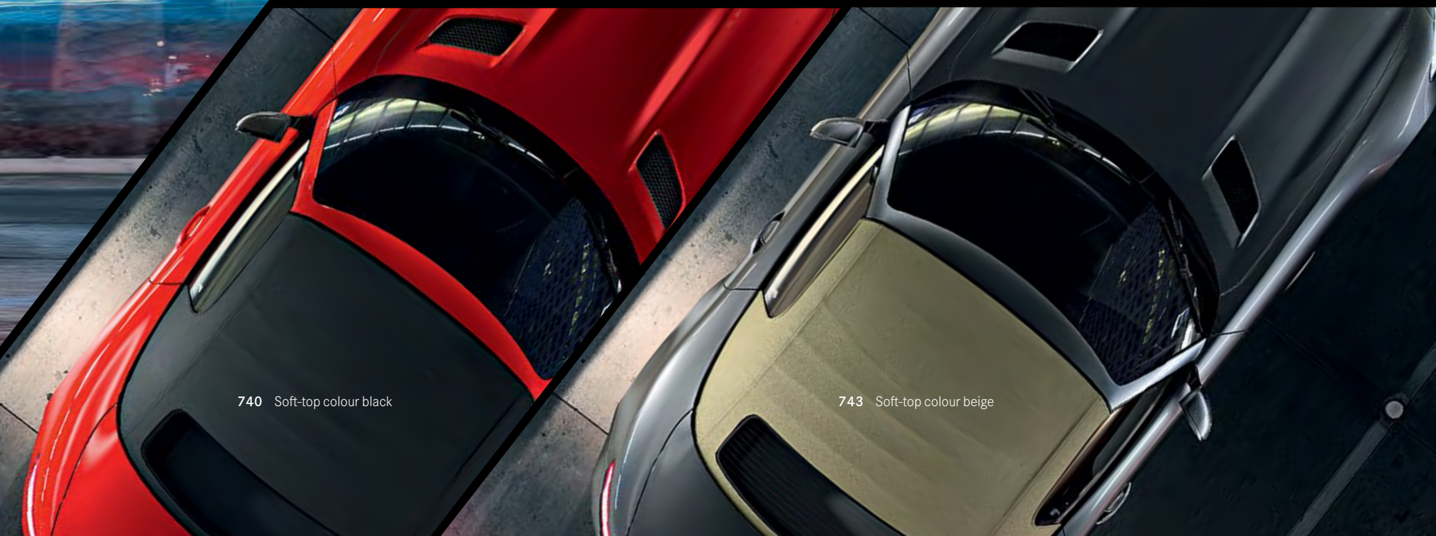
740 Soft-top colour black