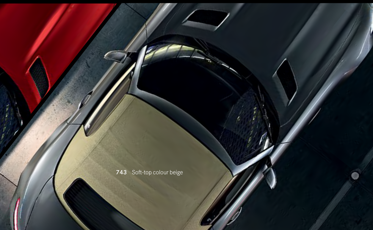
743 Soft-top colour beige