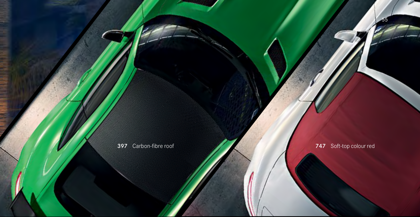
397 Carbon-fibre roof