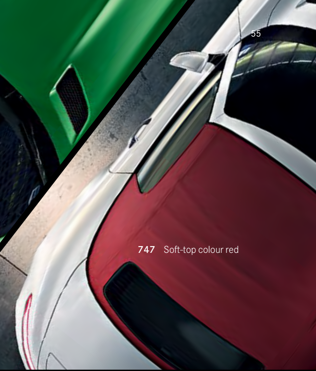
747 Soft-top colour red