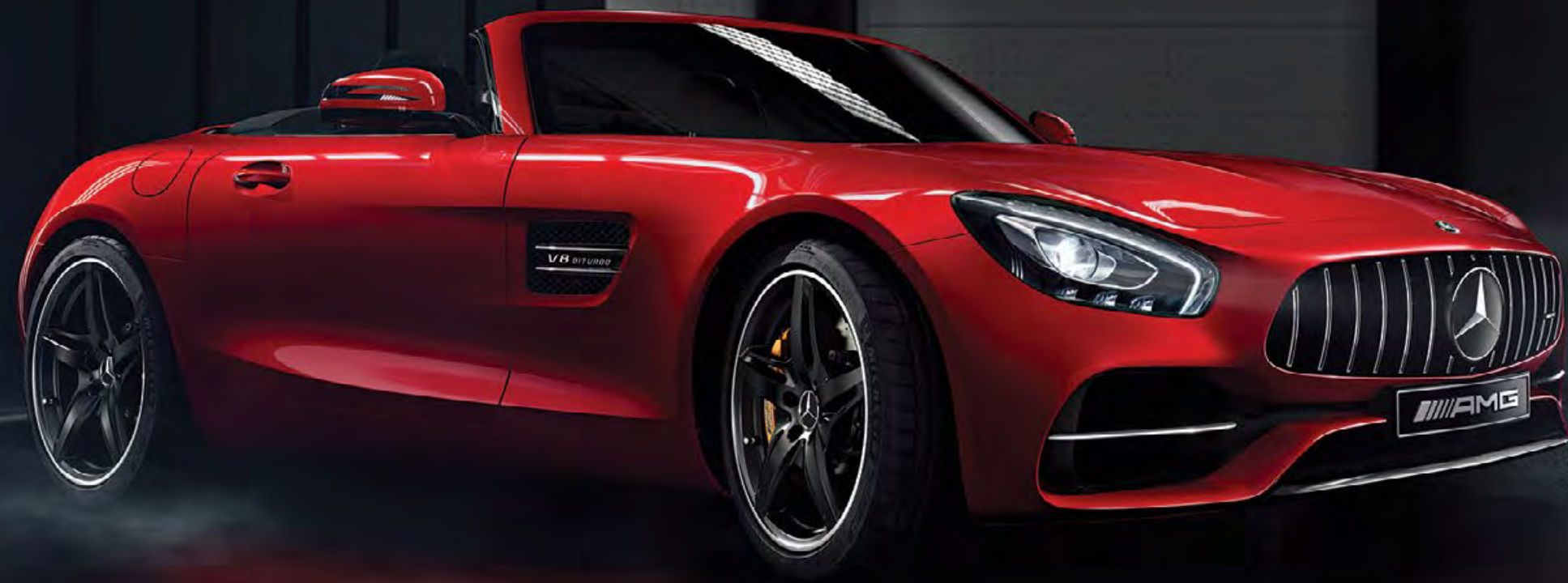
AMG Exterior Chrome Package - Exclusive to Mercedes-AMG GT Roadster

The cool, deeply transparent look of the chrome coating highlights selected elements to best advantage, for example the front splitter, the fins in the side air intakes, the fins in the wings and the roofline trim strip 1 in silver aluminium that outlines the upper edge of the side windows. The exclusive look is rounded off by the chrome-plated trim strip in the diffuser.